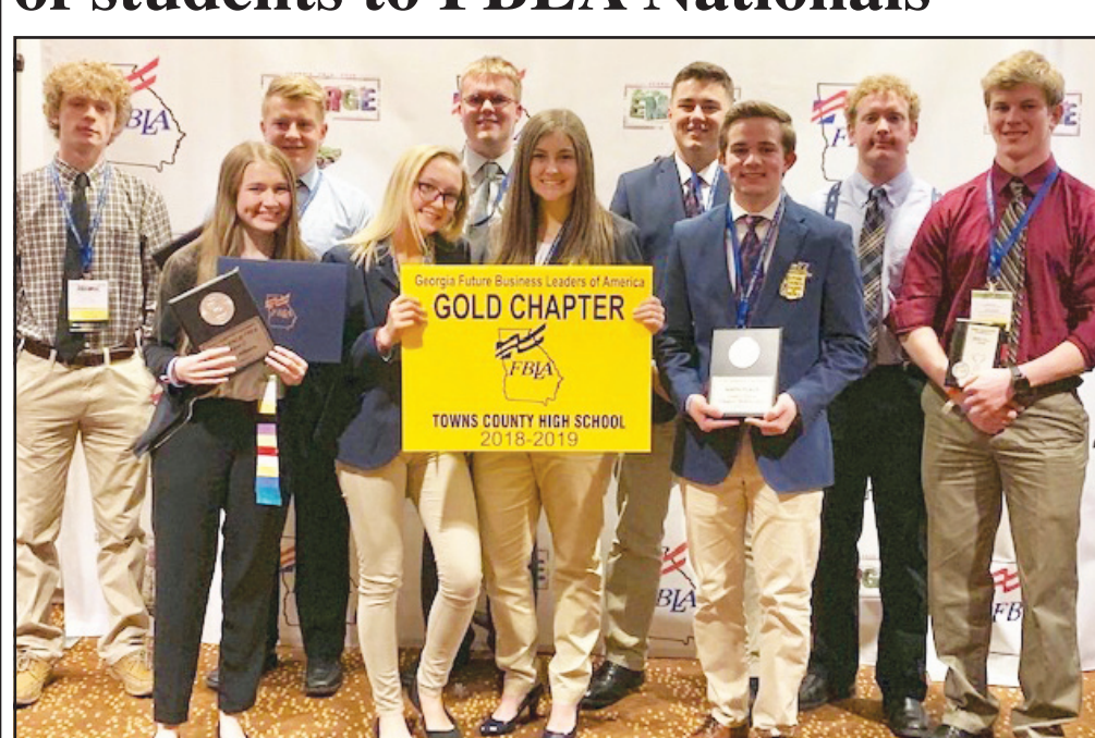
Towns County FBLA students after the awards ceremony at the 2019 State Leadership Conference in Atlanta.